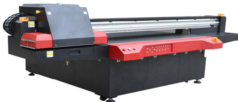
MC2030GV-7H Technical Data Sheet